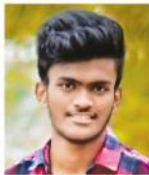
V.E.S. Neeraj II ECE