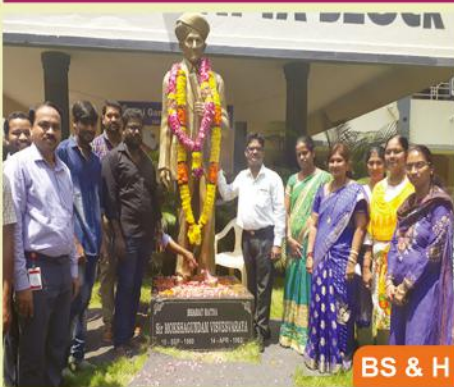
BS & H

ENGINEER'S DAY was celebrated on 15th September 2018 to commemorate the birth anniversary of Sir Mokshagundam Visweswaraya. All the departments involved in Engineer's day celebration and organized different activities like Technical Quiz, Guest Lecture and Power Point Presentation etc.